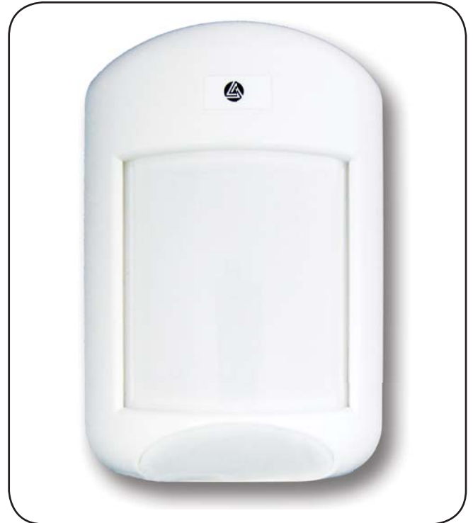
AL40 SERIES PIR INTRUSION DETECTORS

The LED can be fully disabled by removing the LED jumper.